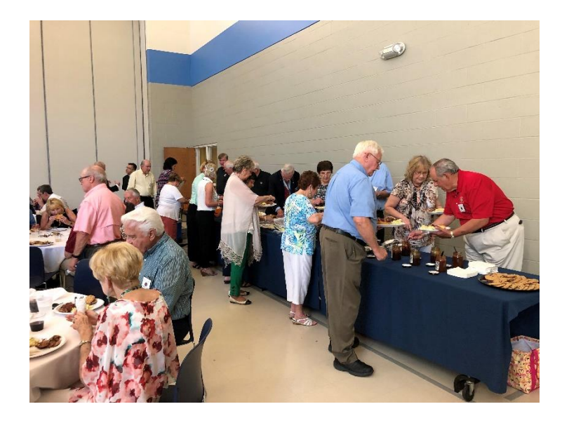
BBQ from Dailies was a hit